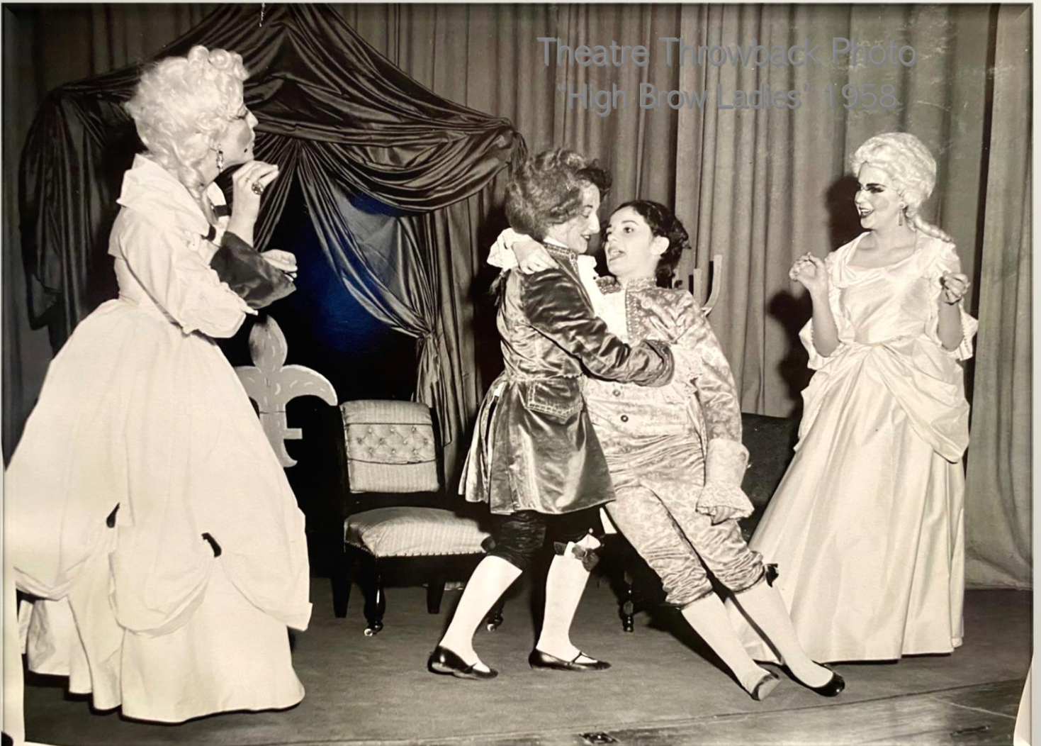
Theatre Throwback Photo “High Brow Ladies” 1958