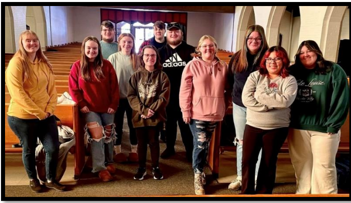
Happy New Year! Our students are back on campus, back in classes, and excited for a great semester!