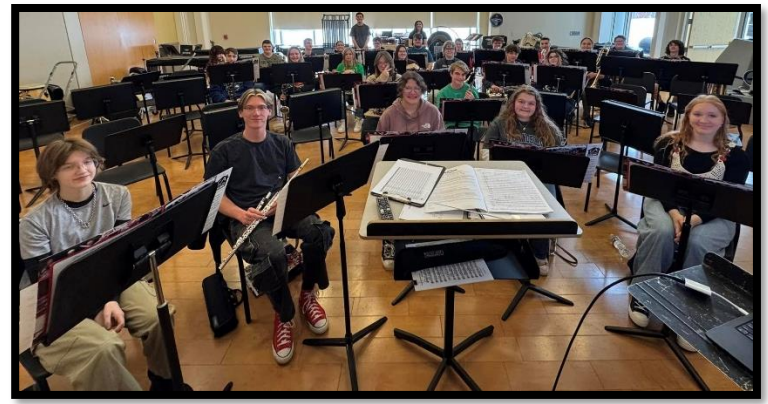
The Muskingum Valley Youth Wind Ensemble had their first rehearsal of the year!