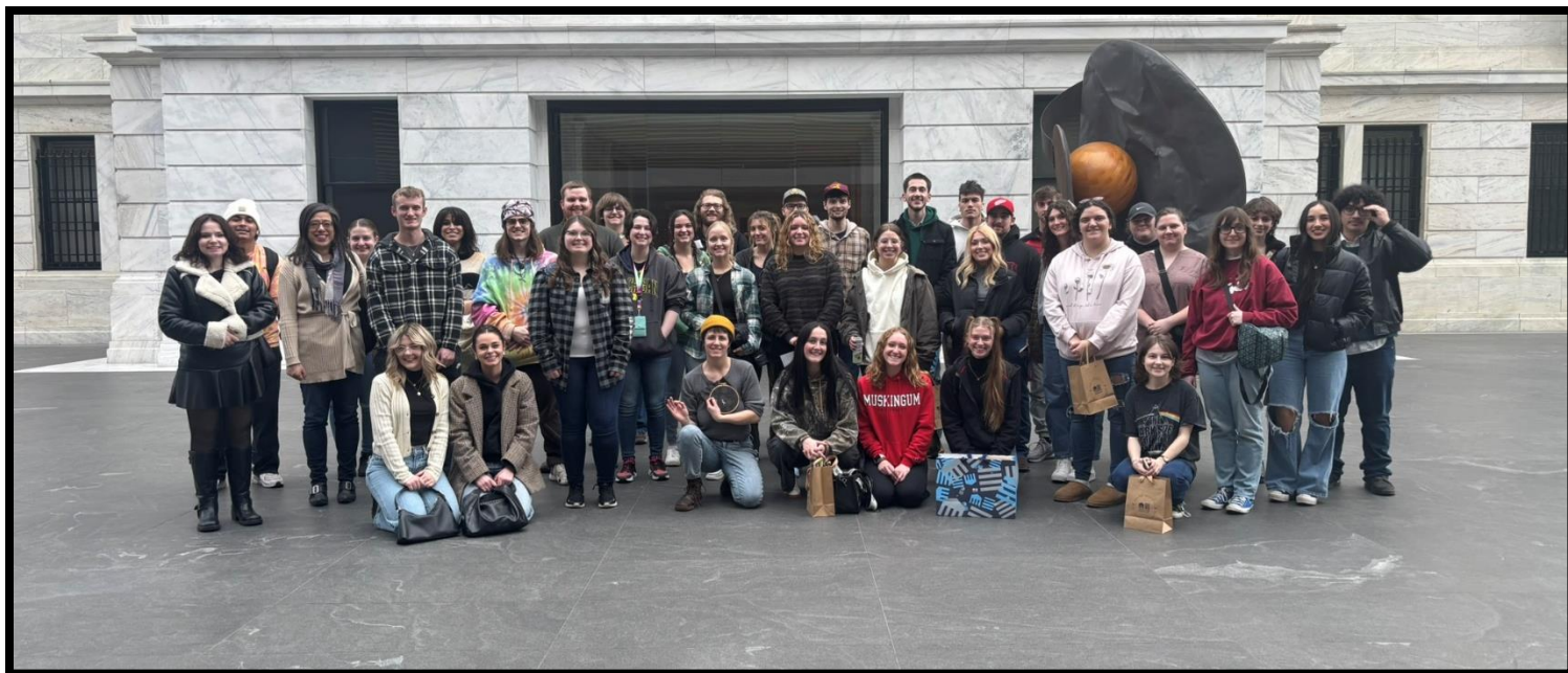
Art students recently traveled to Cleveland to experience the Cleveland Art Museum.