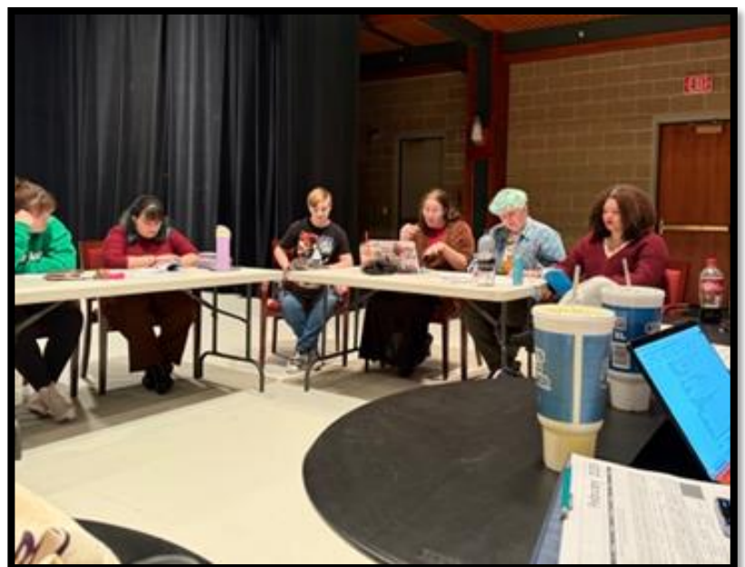
Students participating in the table read of Ugly Lies the Bone in Thompson Theatre.