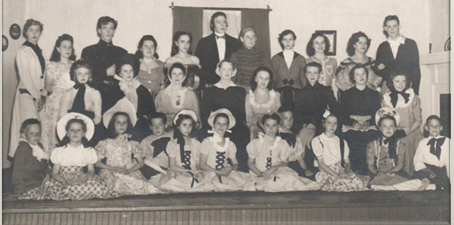
Quality Street – Junior Class Party, 1945