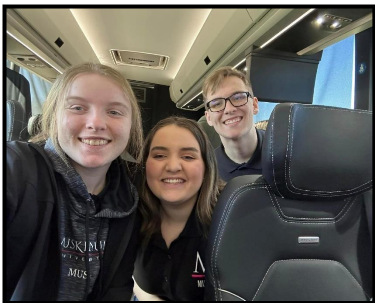
The Wind Ensemble, Concert Choir, String Ensemble, and Muskie Rocks traveled to Chicago for the annual music tour with performances at schools and churches along the way.