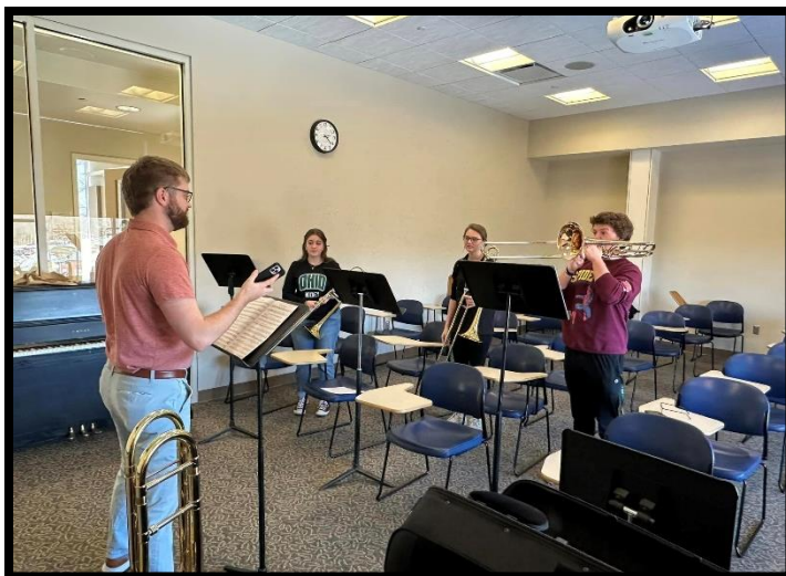
Muskingum students, faculty, and local band directors helped with sectionals and rehearsal for the Muskingum Valley Youth Wind ensemble.