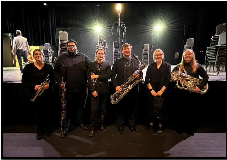
Six music students participated in Ohio Private College Instrumental Conductors Association (OPICA) Honors Festival at the University of Findlay.