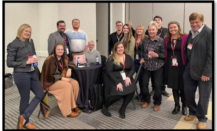
Muskingum hosted an alumni reception at the OMEA Professional Development Conference.