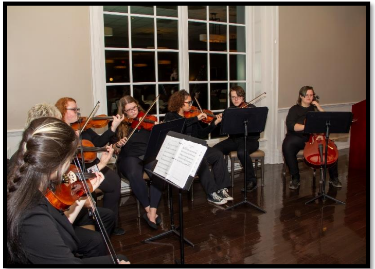
The String Ensemble performed for alumni and the Board of Trustees at the Winter Social at the Columbus Country Club.