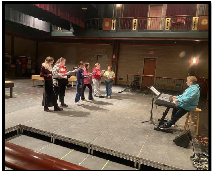
Students are hard at work preparing for the spring musical: Chicago. The show opens on March 21.