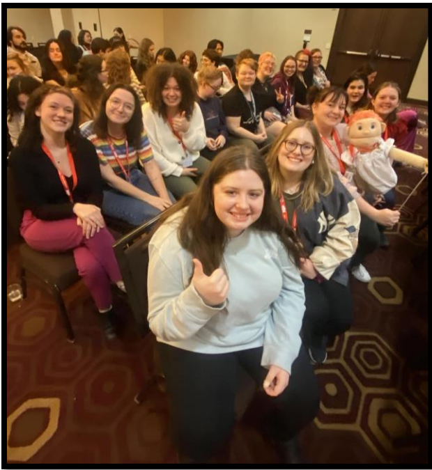
Theatre students and faculty attended the Kennedy Center/American Theatre Festival (KCACTF) in Pittsburgh.