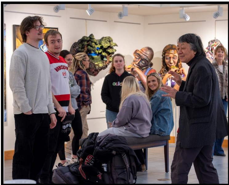
The opening reception for "New Vision in the New Year" had a great turnout. The exhibit runs through February 14 in the Palmer Gallery on campus.