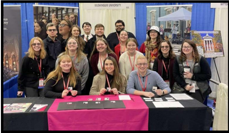
Music students and faculty attended the Ohio Music Education Association (OMEA) Professional Development Conference in Columbus.