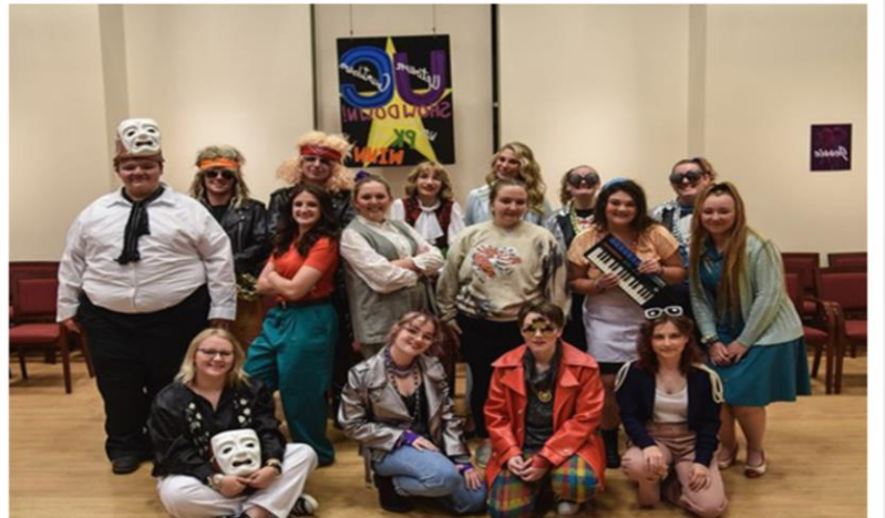
The Funky Fresh, Totally Righteous, Uptown Countdown Showdown! featured the work of 17 first-year theatre students and 4 upper-class students.