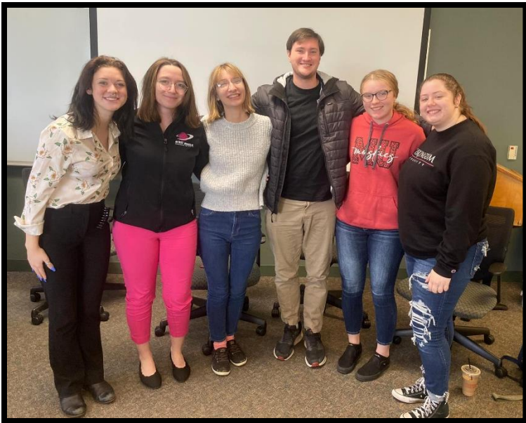
Current students and faculty in art, music, and theatre welcomed prospective students on campus for Scholarship Day.