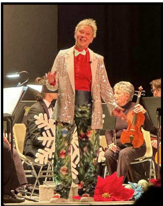
SEOSO presented the annual Holiday Concert at Secrest Auditorium.