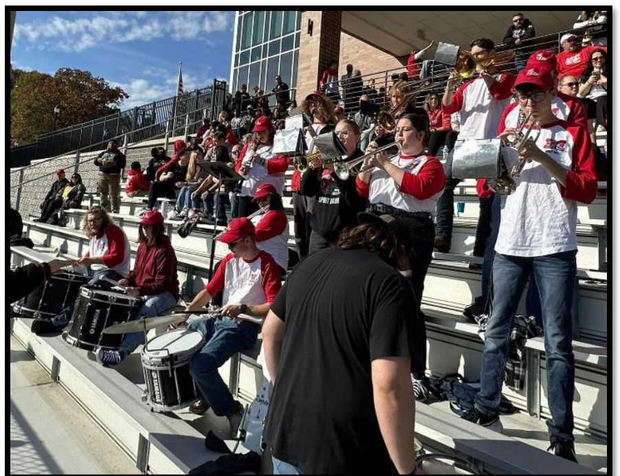
The Spirit Band performed at the final home football game against Wilmington College.