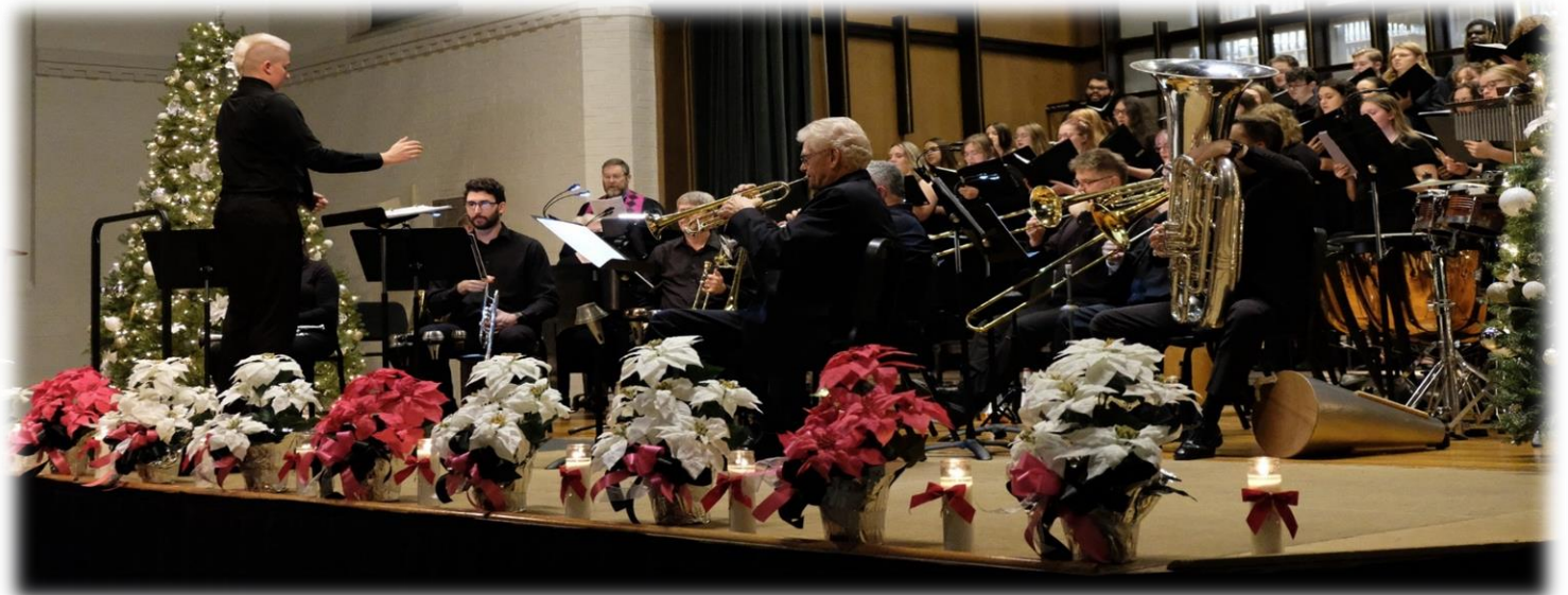
The annual Christmas Festival featured holiday carols, readings, and special musical selections performed by the university choirs and special brass ensemble— comprising music faculty and other professional musicians.