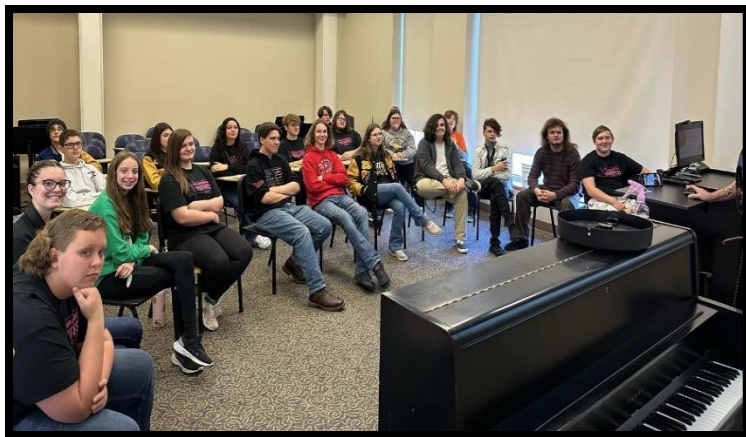
The music department was happy to welcome some 150 high school students on campus for two YouthFests (choral and instrumental), including masterclasses, workshops, rehearsals, and performances with our students and faculty.