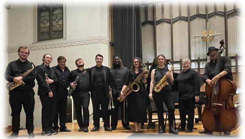
Musical Theatre Ensemble and Jazz Ensemble presented terrific end-of-semester concerts!