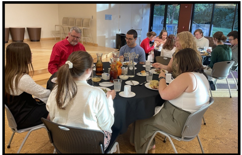
Students attend the etiquette dinner

The Muskingum Programming Board and the Impact Center held its annual etiquette dinner on September 15th. The dinner is designed to teach students on the proper dining and conversation etiquette in a professional dinner setting.